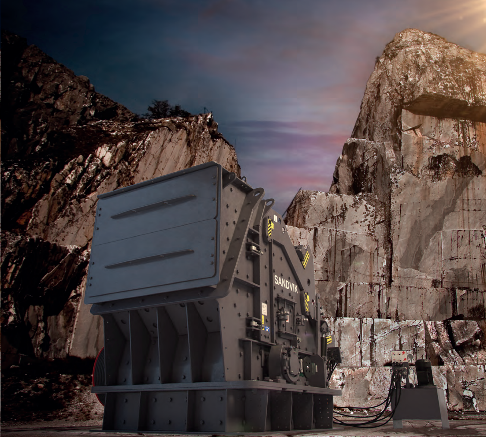
WORKING AS PRIMARY CRUSHER IN THE MORNING...